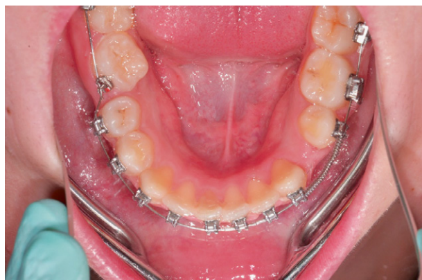
Fig. 8. Occlusal views during orthodontic treatment.

the area of the second and third molars 8 . In the literature, cases of multiple complex odontomas have been rarely reported 10 . Odontomas, as in this case, are most commonly diagnosed on radiography examination taken to determine the cause of missing or malposition of an individual tooth, more frequently in permanent dentition than in deciduous dentition 1,6,9,11-13 . For the same reason, it is recommended for them to be removed early in order to allow proper spontaneous eruption of teeth in dental arch. The treatment of odontoma is surgical and may be associated with orthodontic therapy, i.e. malocclusion correction or orthodontic traction of an impacted tooth caused by the presence of odontoma 7,14 . In the case presented, surgical removal of the odontoma was indicated, as well as monitoring of spontaneous eruption of the affected tooth.