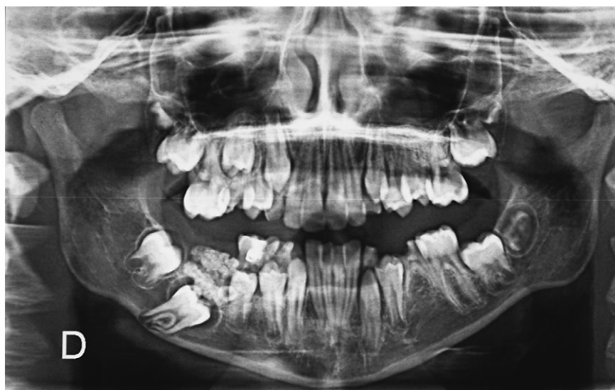
Fig. 2. Orthopantomogram showed a radiopaque mass on the right side of the mandible above the impacted 46.