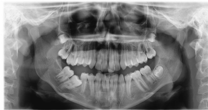
Fig. 7. Orthopantomogram taken six months after the surgery.

In this case, two complex odontomas are shown, localized above the crown of the first right mandibular permanent molar causing its impaction. Complex odontomas are most commonly found in lower jaws in