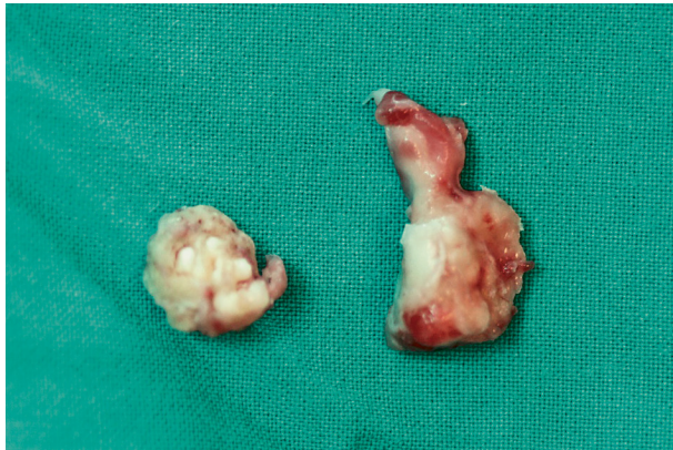
Fig. 5. Complex odontomas removed by the surgery.

sional diagnosis of multiple complex odontomas was established. In agreement with the orthodontist, surgical procedure was planned to remove odontomas under general anesthesia, after which spontaneous eruption