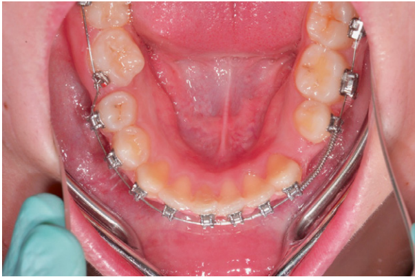
Fig. 8. Occlusal views during orthodontic treatment.

the area of the second and third molars 8 . In the literature, cases of multiple complex odontomas have been rarely reported 10 . Odontomas, as in this case, are most commonly diagnosed on radiography examination taken to determine the cause of missing or malposition of an individual tooth, more frequently in permanent dentition than in deciduous dentition 1,6,9,11-13 . For the same reason, it is recommended for them to be removed early in order to allow proper spontaneous eruption of teeth in dental arch. The treatment of odontoma is surgical and may be associated with orthodontic therapy, i.e. malocclusion correction or orthodontic traction of an impacted tooth caused by the presence of odontoma 7,14 . In the case presented, surgical removal of the odontoma was indicated, as well as monitoring of spontaneous eruption of the affected tooth.