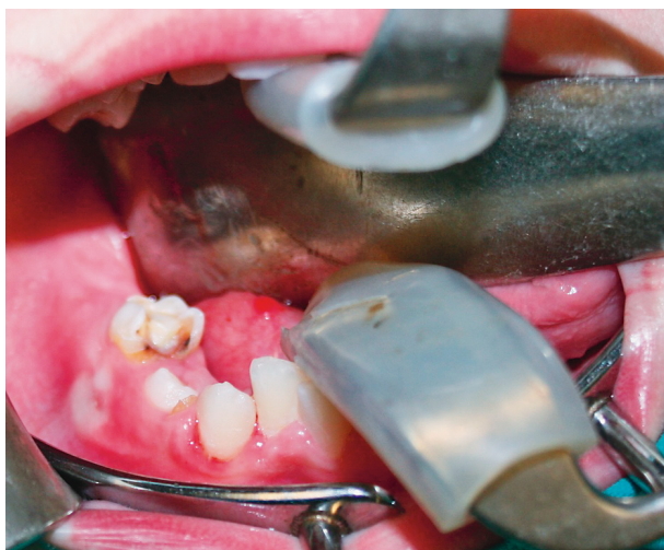
Fig. 1. Intraoral photograph before the surgery.

Extraoral examination revealed no facial asymmetry. Intraoral clinical examination revealed a stage of mixed dentition with decayed deciduous teeth and absence of the first right mandibular permanent molar, 46. Slight expansion of the cortical bone from the vestibular and lingual side was present in the area of the first right mandibular permanent molar, with solid consistency and without symptoms (Fig. 1). On the performed orthopantomogram, a radiopaque well-defined mass was observed above the crown of the first right mandibular permanent molar, of similar intensity of calcified dental tissues, surrounded by a radiolucent