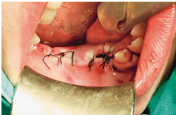
Fig. 6. Intraoral photograph after the surgery: the flap was closed with 3.0 silk sutures.

of the impacted tooth followed. If spontaneous eruption would not occur, an orthodontic-surgical approach is a treatment option to preserve impacted permanent teeth, surgical exposure and orthodontic traction of teeth.