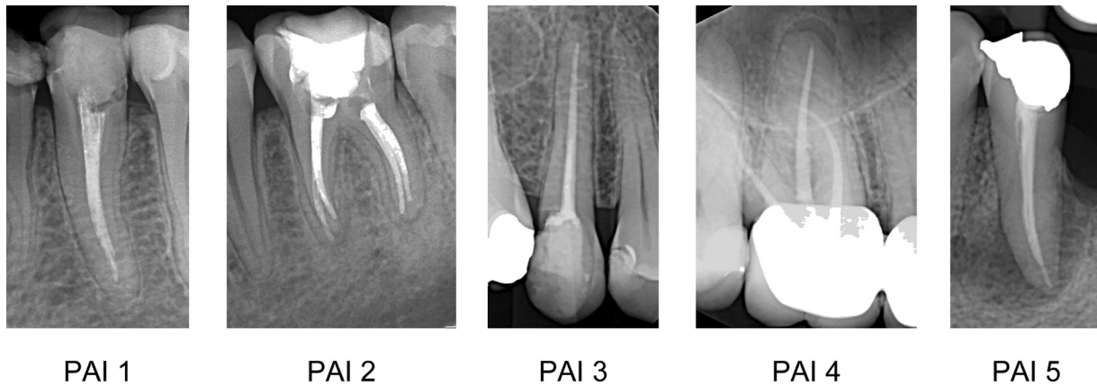
Fig. 1 Periapical radiographs of endodontically treated teeth originating from investigated material representing each of the five periapical index (PAI) scores. Absence of apical periodontitis: PAI = 1 and PAI = 2. Presence of apical periodontitis: PAI = 3, PAI = 4, and PAI = 5.