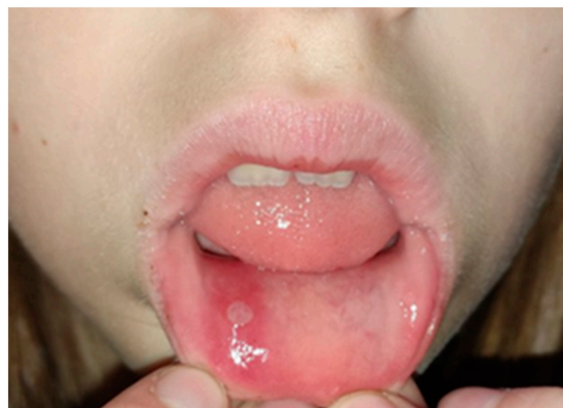
Figure 2. Aphtae minor.

Differential diagnosis is aimed at differentiation between aphtae and herpetic gingivostomatitis, herpangina, and ulcerations caused by injury [9]. Treatment is usually symptomatic and implies the use of topical anesthetics for pain control, antiseptic mouthwashes